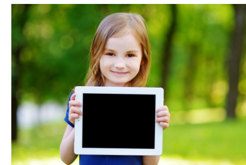
Midzi, bringing online learning one classroom at a time

What is your story? What did it take for you to succeed (or fail) through school? Visit our Facebook page, and share your story!